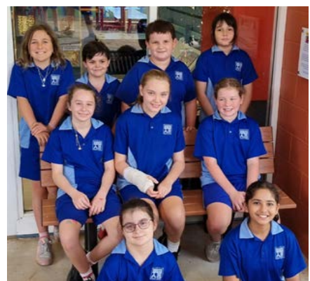
Library Monitors 2024