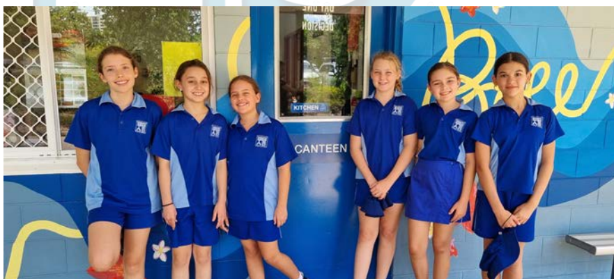
Canteen Helpers 2024