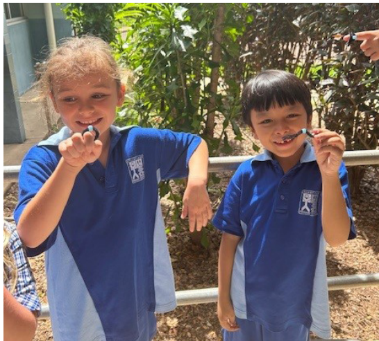
Year 2 students were amazed to see their bead change colour in the sunlight!