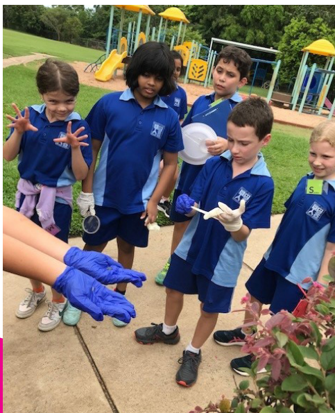
Students in Year 4 learn about what living things need to survive and how they interact and rely on specific natural environments for this survival.