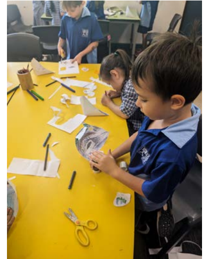
Year 1 making habitat trioramas