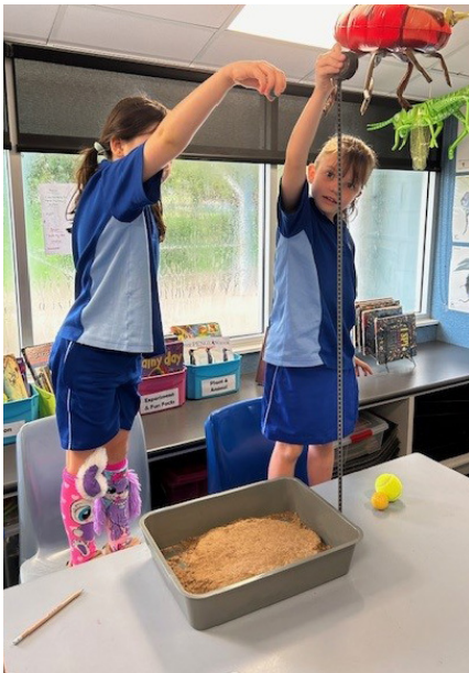
Year 3 dropping balls into sand to make craters