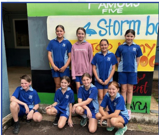
Canteen Helpers 2025