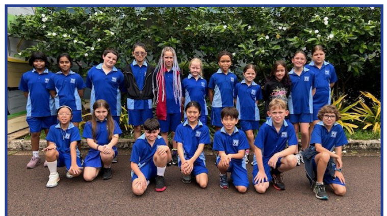
Library Monitors 2025